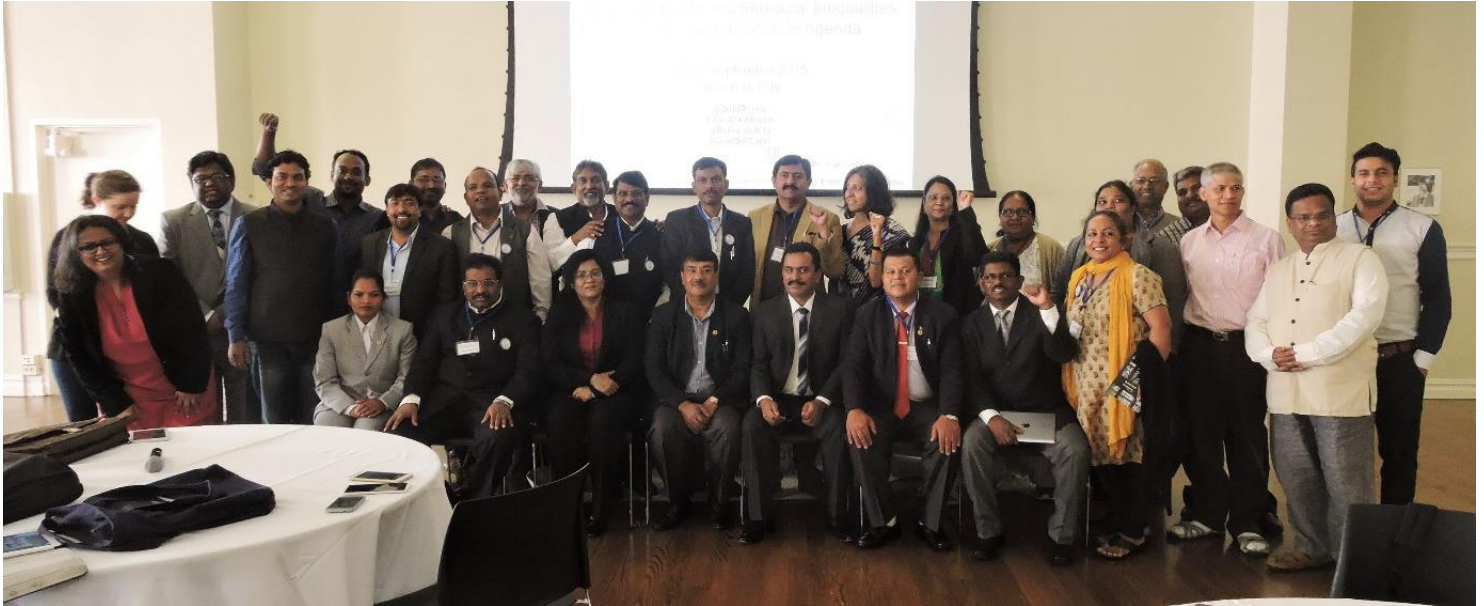
ADRF and APFDC Members Meet for the UN-SDG meet in New York, September 2015